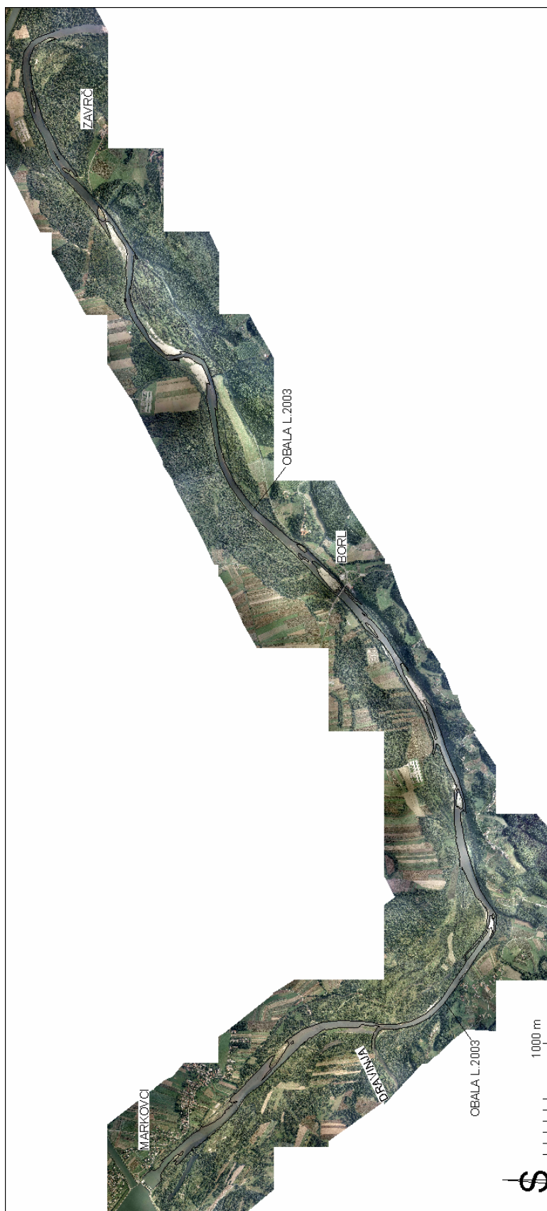
Slika 3. Digitalni ortofoto iz leta 2003 s poudarjeno obalno linijo (Geodetski zavod Slovenije d.d). Figure 3. Digital orthophoto of 2003 with the water body outlined (Geodetski zavod Slovenije d.d.).