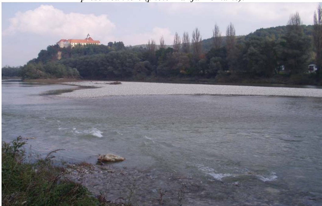
Slika 9. Prodišče oktobra 2005 po visoki vodi z maksimalnim pretokom približno 1100 \text{ m}^3/\text{s} . Pogled z levega brega. Dobro je viden preoblikovani gorvodni del prodišča ter nespremenjen dolvodni del.

Figure 8. The gravelbar in October 2005 after a high flow of 1100 \text{ m}^3/\text{s} . The loaded gravel and an enlarged width of the upstream part is visible. The downstream area of the bar remained unchanged, because of the woody overgrowth in the downstream part. Even the grass was preserved there.