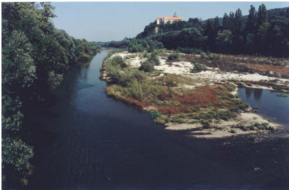
Slika 4. Delno poraslo prodišče dolvodno od mostu v Borlu 20. 9. 2003. Vidnih je nekaj vrbov ter travinje. Na levi je "nestabilna" brežina. Pogled je dolvodno. Na digitalnem ortofotu iz leta 2003 (slika 2) je prodišče skoraj popolnoma neporastlo. Vzrok za nenadno napredovanje zarasti v letu 2003 ni jasen. Gosta lesna zarast na skrajnem dolvodnem delu je starejša. Figure 4. Partly overgrown gravelbar downstream the bridge in Borl, 20 Sept. 2003. Some willows and grassland are visible. The "unstable" bank is on the left. Downstream view. On the digital orthophoto of 2003 (Fig. 2) there is hardly any overgrowth on this gravelbar. The cause for the sudden progress of the overgrowth in 2003 is not clear. The compact woody overgrowth far downstream is older.