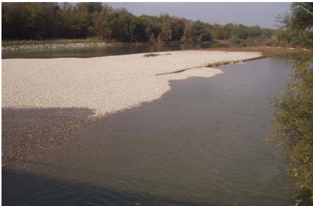
Slika 8. Prodišče oktobra 2005 po visoki vodi z maksimalnim pretokom približno 1100 \text{ m}^3/\text{s} . Viden je narinjen prod ter povečana širina gorvodnega dela prodišča. Zaradi ohranjenega dolvodnega dela prodišča z gosto zarastjo je del prodišča dolvodno ostal nespremenjen, ohranilo se je celo travinje.

Figure 8. The gravelbar in October 2005 after a high flow of 1100 \text{ m}^3/\text{s} . The loaded gravel and an enlarged width of the upstream part is visible. The downstream area of the bar remained unchanged, because of the woody overgrowth in the downstream part. Even the grass was preserved there.