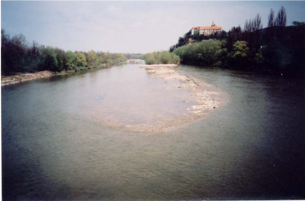
Slika 6. Prodišče v začetku aprila 2005, po posegu. Verjetno je pretok rahlo povečan. Vidno je ohranjen dolvodni del prodišča z gosto lesno zarastjo. Levo je nova kamnita zložba.

Figure 6. The gravelbar in the beginning of April 2005, after the intervention. The flow probably slightly increased. A preserved part of the gravelbar downwards with compact woody overgrowth is visible. Left is the new rip-rap.