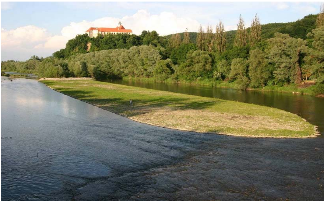
Slika 7. Prodišče konec aprila 2005. Viden je izredno hiter pojav travinj. V spodnjem desnem delu fotografije je obsežna plitvina (foto Marija Meznarič).

Figure 6. The gravelbar in the beginning of April 2005, after the intervention. The flow probably slightly increased. A preserved part of the gravelbar downwards with compact woody overgrowth is visible. Left is the new rip-rap (photo Drava VGP Ptuj d.d.).