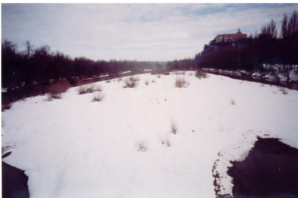
Slika 5. Zasneženo prodišče marca 2005, pred posegom. Glede na leto 2003 ni opaznega razraščanja vrbovja (foto Drava VGP Ptuj d.d.). Figure 5. The snow covered gravelbar in March 2005, before the intervention. If compared to 2003 no further growth of willows is noted (photo Drava VGP Ptuj d.d.).