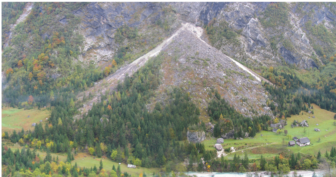
Slika 1. Skalni podor Osojnik v dolini Trente (foto: avtorji, 2004). Figure 1. The Osojnik rockfall in the Trenta valley (photo: authors, 2004).

Skalni podori različnega dosega so predvsem v gorskem svetu pogosta in obnem zaradi svoje energije običajno zelo intenzivna oblika naravnih tveganj (Brilly et al. , 1999). Tipičen primer skalnega podora v ozki alpski dolini je npr. podor Osojnik v dolini Trente (slika 1).